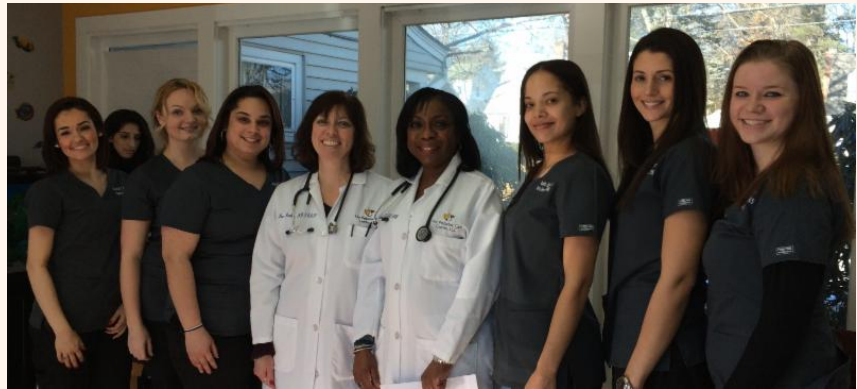
Pediatric Care Center

Every year, the providers at the Pediatric Associates of CT P.C. in Waterbury have participated in a holiday gift exchange