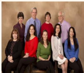
Pediatric Associates of CT Staff

Every year, the providers at the Pediatric Associates of CT P.C. in Waterbury have participated in a holiday gift exchange