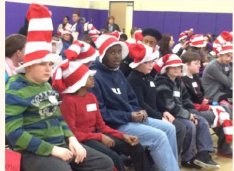
Children of CCMC School